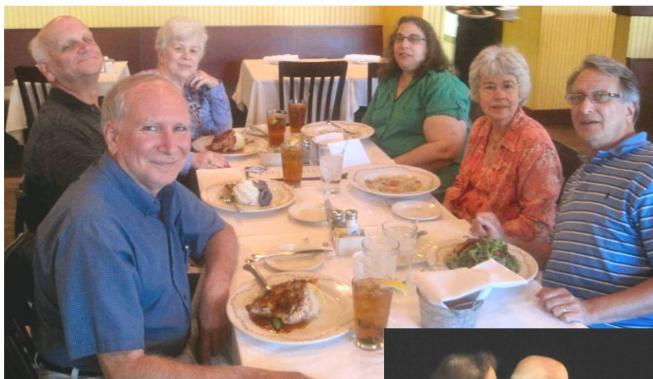
A few members of the DC2011 Program Committee.