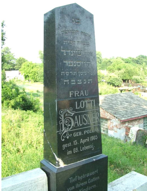
Lotti Hausner (née Pollak) Died 15 April 1905 at age 69